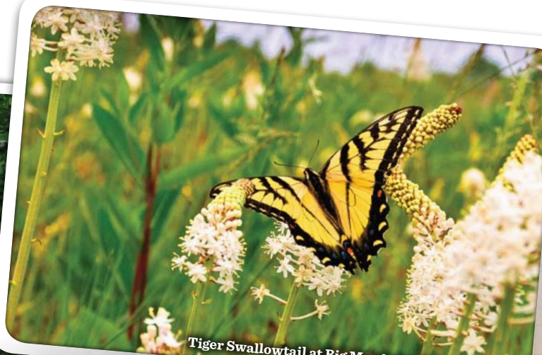
Tiger Swallowtail at Big Meadows