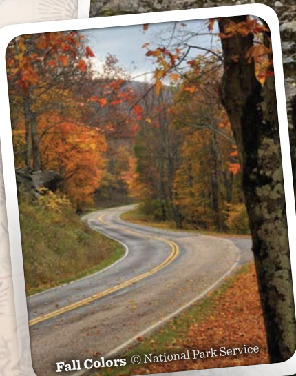
Fall Colors