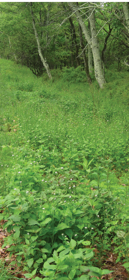
Garlic mustard-infested roadside near Big Meadows