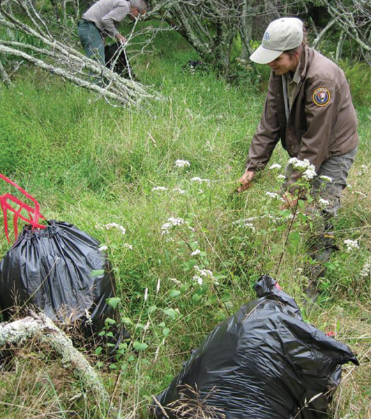
Biotechs and volunteers pull invasive plants